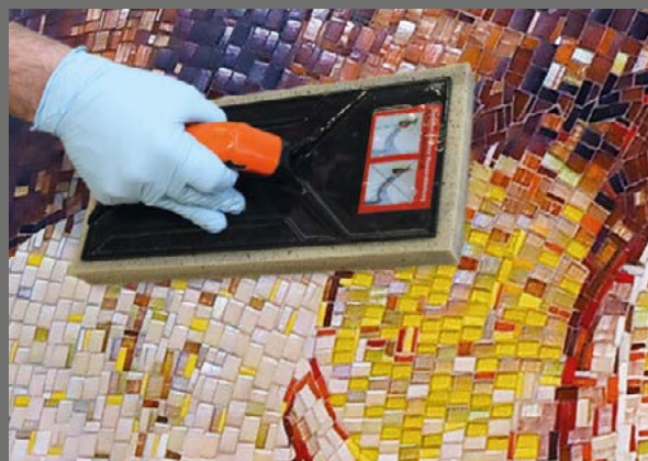
Very easy washing without residual smearing – with PCI Durapox® Finish washing aid.