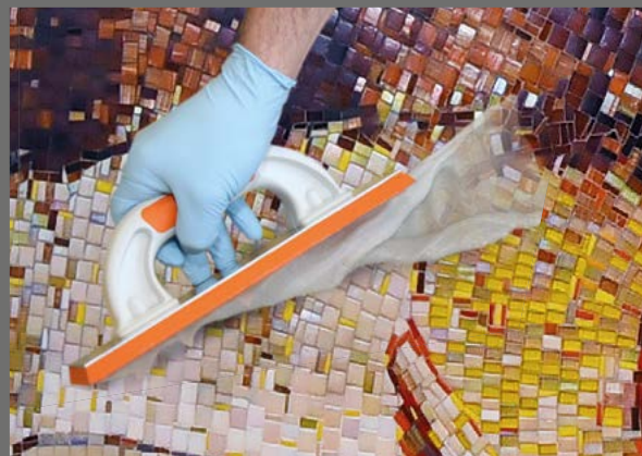
Very creamy insertion behavior, like a cementitious grout. Only one hand needed, no special tools required.