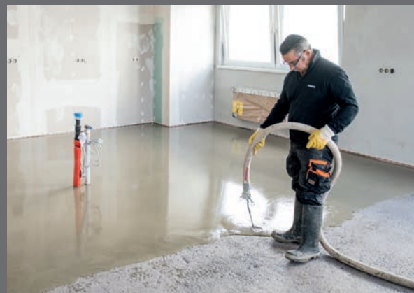
PCI Novoment® Flow can be applied by hand or machine.