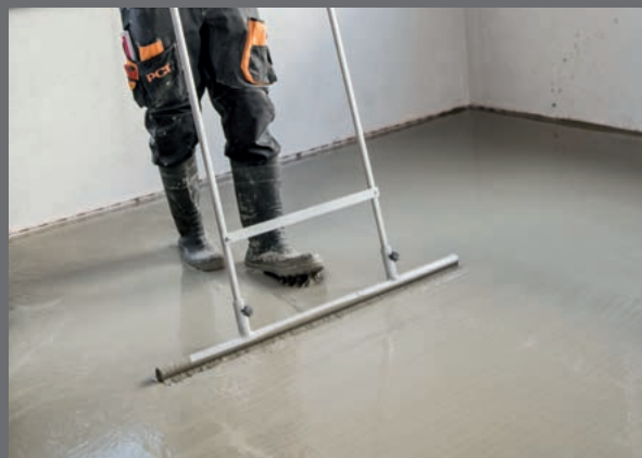
Working in a standing position is extremely convenient.