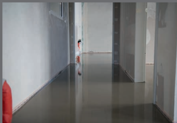
Very convenient and highly efficient in processing, PCI Novoment® Flow also offers an impressive result.